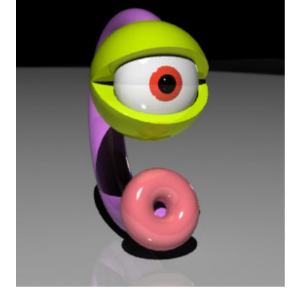
Keep it simple. These arecharacters that might be used in a young childs game. Use no more than 3 or 4 parts.