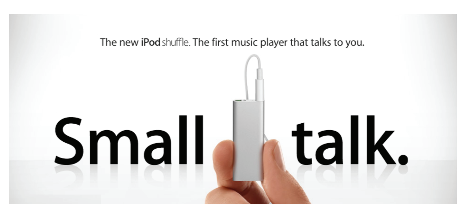
Text visually compliments the image

Is information presented in a meaningful manner?