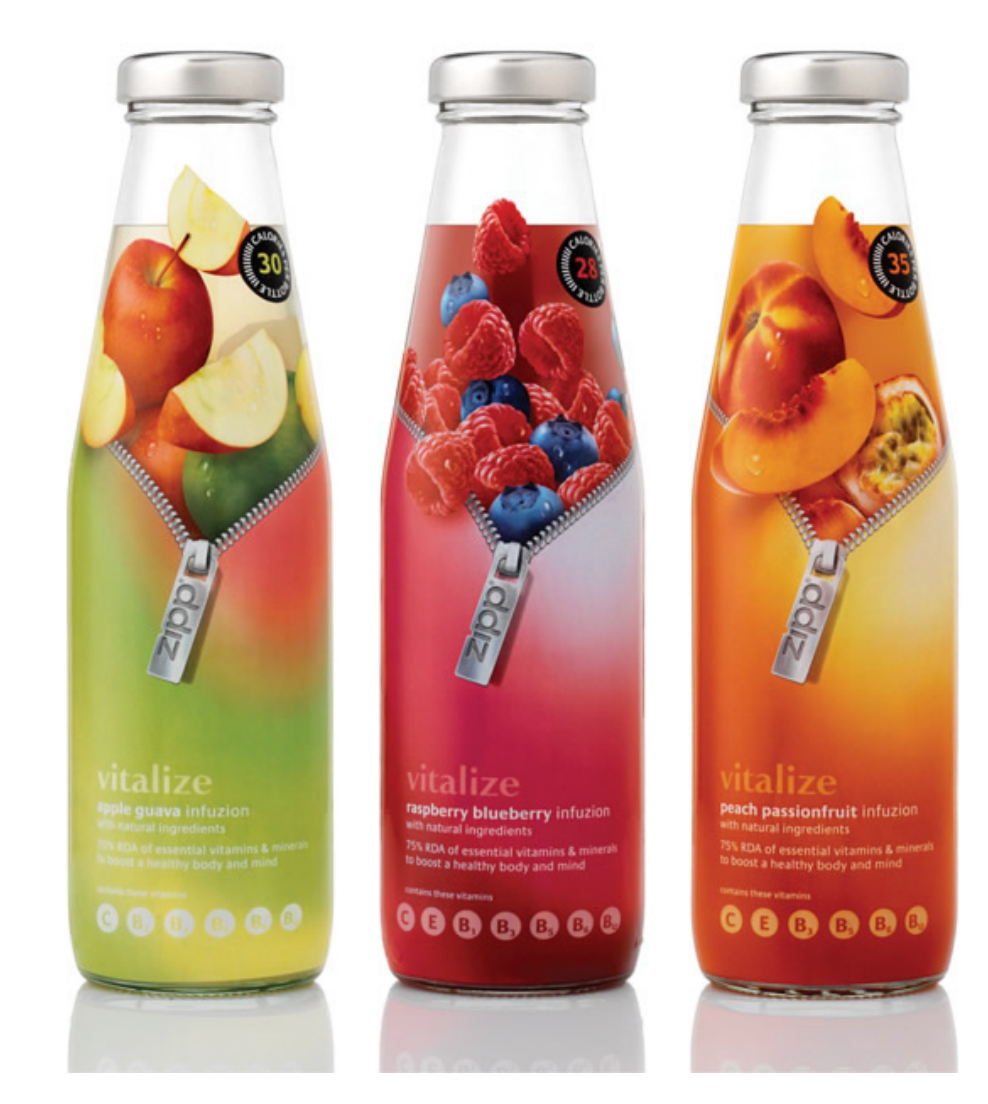
Illustrations clearly indicate flavors