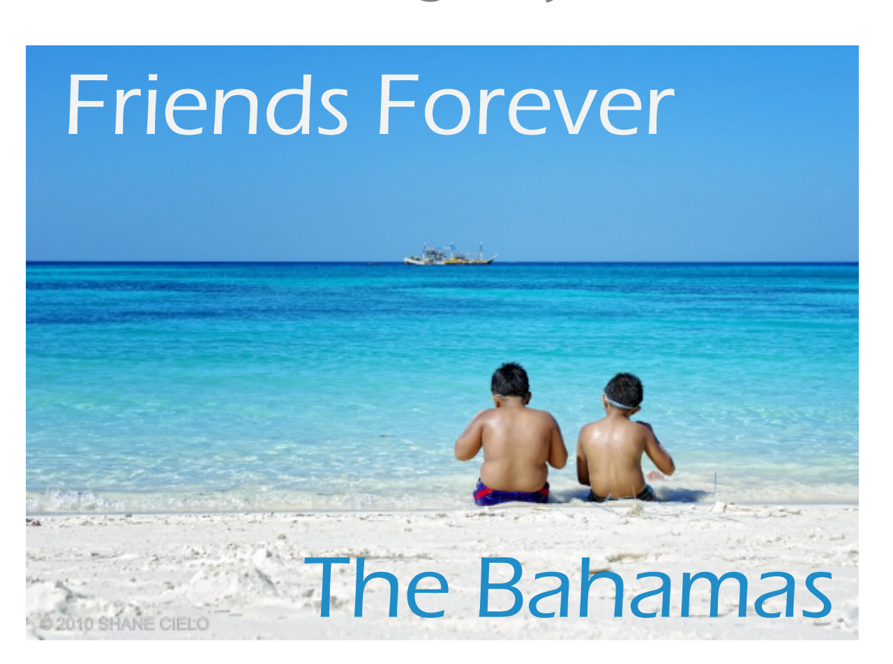
What's "The Rule of Thirds"?