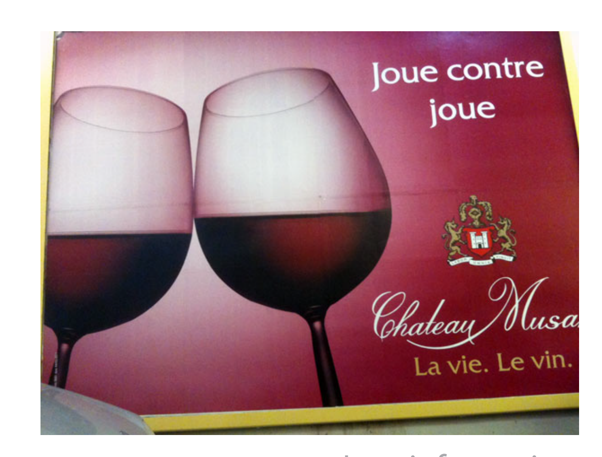
Less information can give a clean look of elegance and subliminal imagery