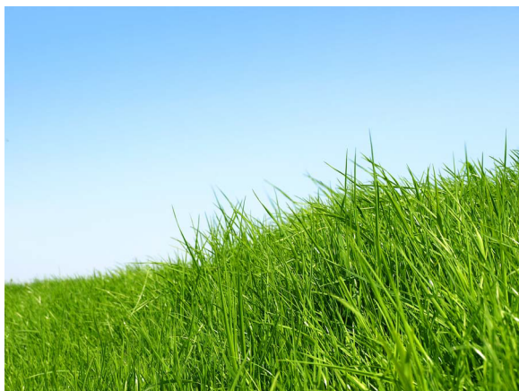
High Res - 300 DPI

Digital images are composed of rows of tiny squares called pixels (dots). The more dots an image has, the sharper the image. Printing requires that an image have 300 dots per inch. To be seen clearly on the web (a computer monitor) the image only needs have 72.