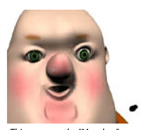
This guy uses the "Morpher" modifier to create facial animation

Advanced projects require the use of skills learned in the beginning and intermediate projects as well as new skills such as "Morphing", Displacement Mapping" and more. The instructions are often less specific. They might require critical thinking skills asking you to decide what to do based on how you want the project to look.