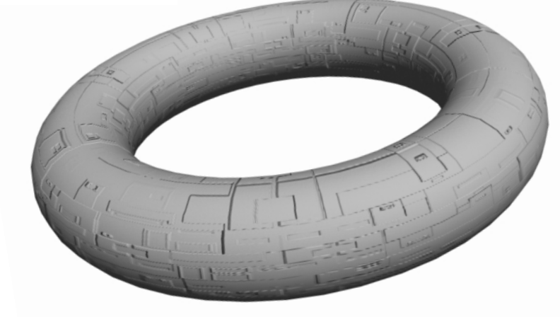
Bump maps- custom and pre-made