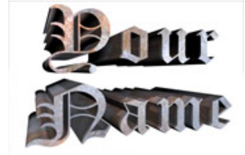
Extruding a "Text" shape is all you do for the this project.