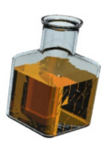
The two models placed together, Bottle and Liquid