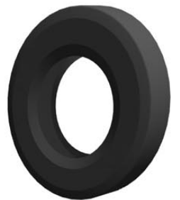
A car tire lathed from a spline.