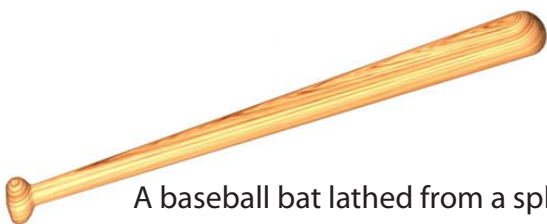
A baseball bat lathed from a spline