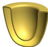
A cup lathed from a spline